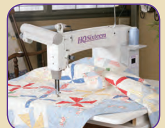
HQ SIXTEEN® SIT-DOWN