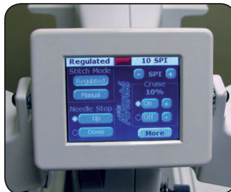
COLOR TOUCH-SCREEN ON FRONT AND BACK HANDLEBARS