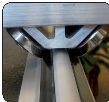
PRECISION-GLIDE ALUMINUM TRACK SYSTEM AVAILABLE

SEE YOUR TRAINED HQ REPRESENTATIVE FOR DETAILS.