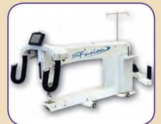
HQ 24 FUSION®